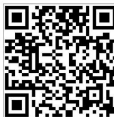
VIDEO DEMONSTRATION M630

Article Code : M630C EAN Code : 3234640062815